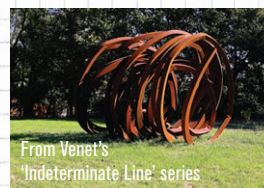
From Venet's 'Indeterminate Line' series

On May 20 the Texan French Alliance for the Arts hits Becca's to auction $200,000 in masterpieces such as a diamond-dusted Damien Hirst skull to help install 15 imposing metal works by Bernar Venet in the park next year. To help keep up the art-studded green space, the conservancy had raised $409,000 a month before at a dedication event for the reno'd lake plaza.