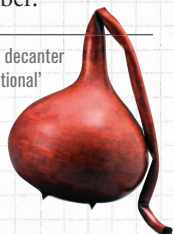
Jerry Bennet's decanter from 'dysFUNctional'

A March 14 affair at the Center for Contemporary Craft mixes glass-blowing with partying to raise $20,000 . Later, an art auction also helps raise cash to support exhibits like dysFUNctional last September.